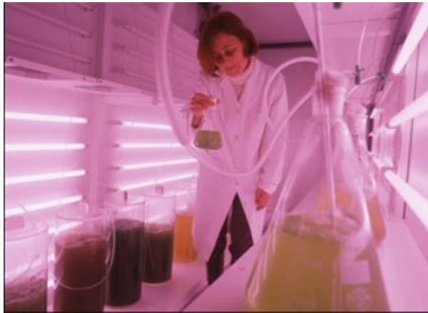
Department of Marine Sciences at Cadiz University (Spain)

The former programmes Urban II and Equal are integrated into the Convergence and Regional Competitiveness and Employment objectives.