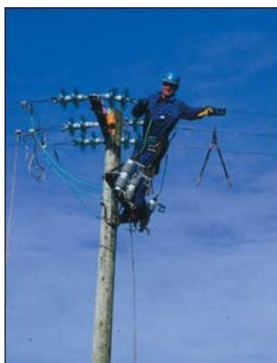
Electrification of the Aran Islands (Ireland)

The rationale of the Convergence objective is to promote growth-enhancing conditions and factors leading to real convergence for the least-developed Member States and regions. In EU-27, this objective concerns – within 17 Member States – 84 regions with a total population of 154 million, and per capita GDP at less than 75 % of the Community average, and – on a “phasing-out” basis – another 16 regions with a total of 16.4 million inhabitants and a GDP only slightly above the threshold, due to the statistical effect of the larger EU. The amount available under the Convergence objective is EUR 282.8 billion, representing 81.5 % of the total. It is split as follows: EUR 199.3 billion for the Convergence regions, while EUR 14 billion are reserved for the “phasing-out” regions, and EUR 69.5 billion for the Cohesion Fund, the latter applying to 15 Member States.